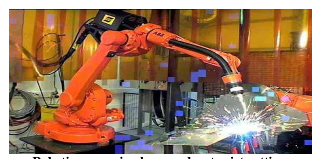
Robotic processing laser and water jet cutting

The support for sustainability practices in manufacturing can be enhanced by implementing full robotic automation. As presented by Robotic [5], robotic handling operations (machine tending, palletizing and moulding) accounts for 38% manufacturing operations. Also, robotic welding, robotic assembly (press-fitting, inserting, and disassembling), robotic dispensing (painting, gluing, and spraying), robotic processing (laser and water jet cutting) accounts for 29%, 10%,4% and 2% respectively. The cost of welding robots is going down, making it easier to automate a welding process. The robot may be directed by a predetermined program, be guided by machine vision, or follow a combination of the two methods. The benefits of robotic welding have demonstrated to make it a technology that helps many manufacturers increase precision, repeatability, and output.